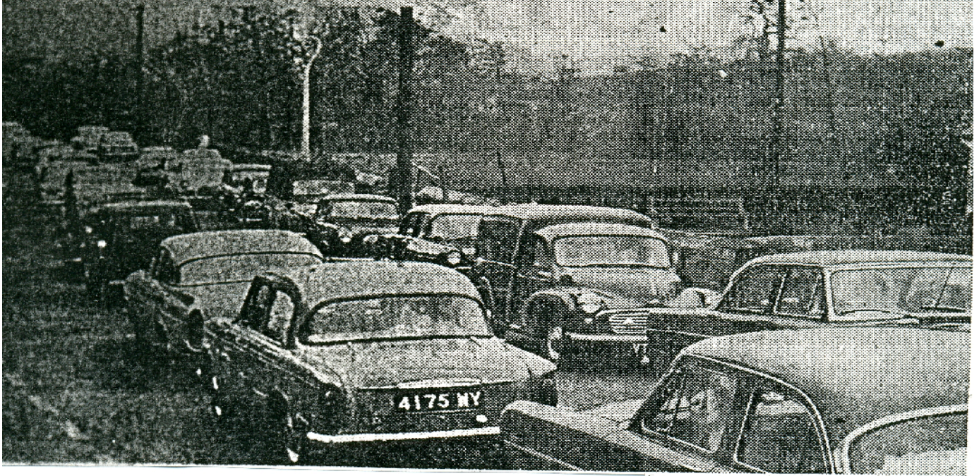
TRAFFIC streams in both directions at Bowcliffe Road, Bramham, as holidaymakers wend their way home last night from coast and country. As our clock shows, the time was about 7 p.m.